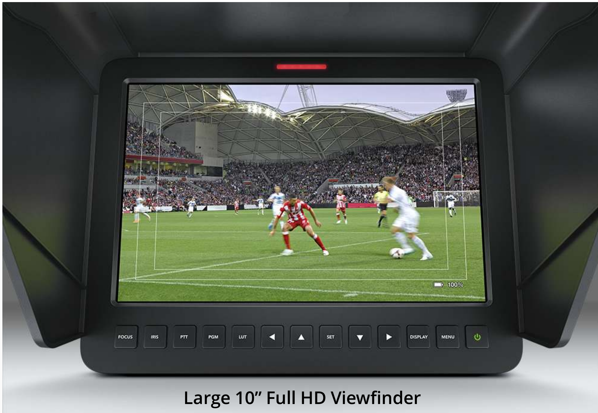
Large 10" Full HD Viewfinder